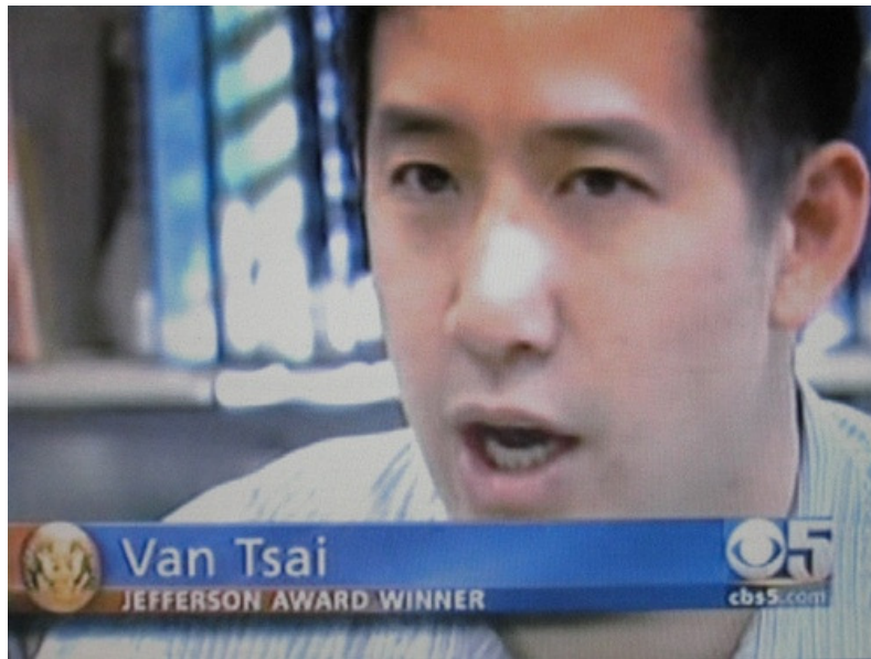
Awarded by CBS Channel 5 News